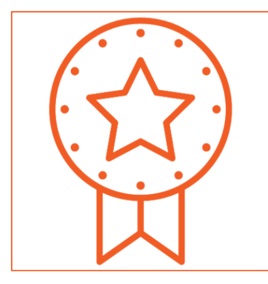
Education and Awareness