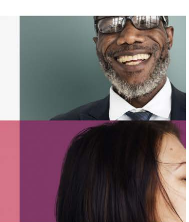
Transforming how we think, plan, and practice